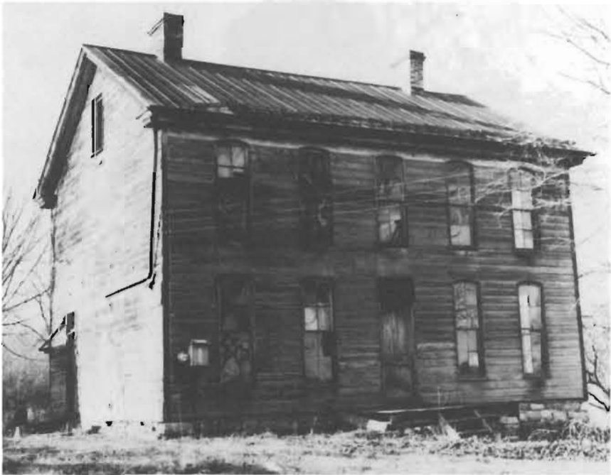
FERNSNER HOUSE BEHIND LOCKHOUSE 49