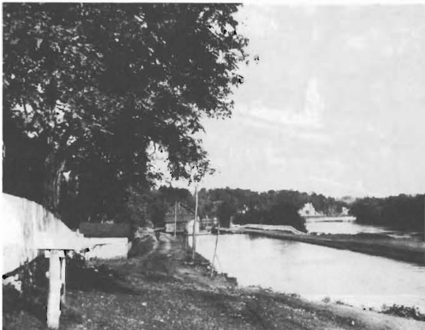
WATERED FOUR LOCKS. SNYDER-FERNSNER STORE IN BACKGROUND