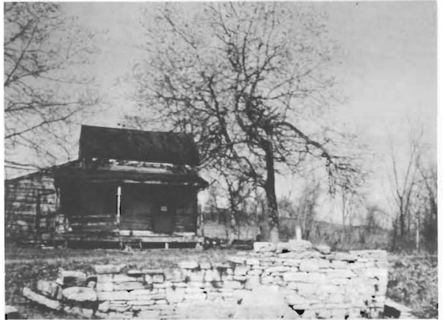
HOUSE ACROSS LOCK 50, THE CANAL BERM