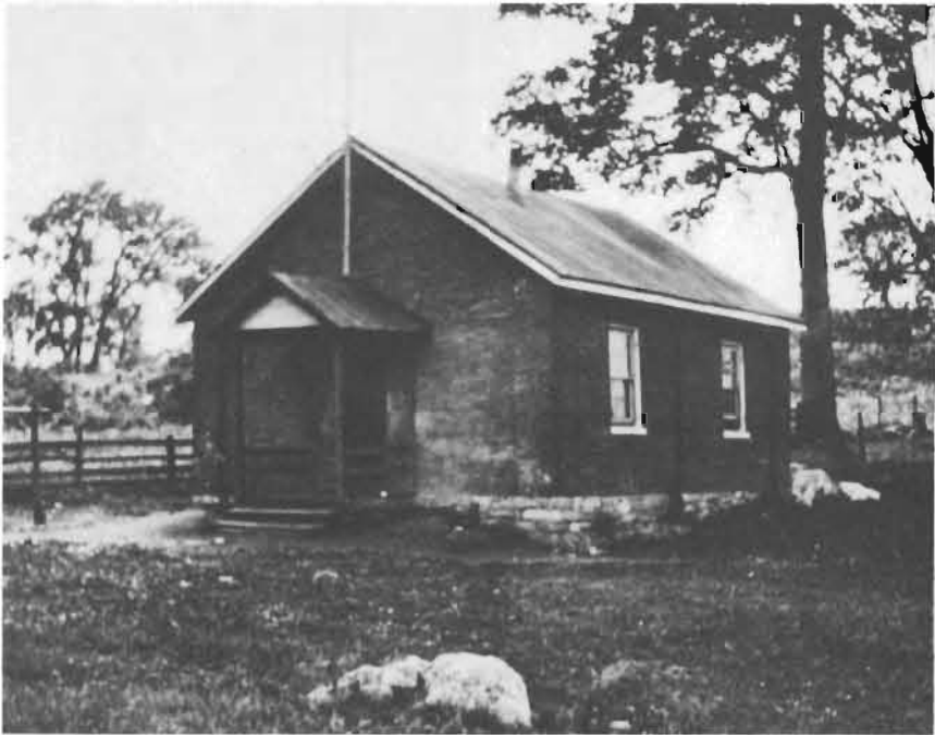
FOUR LOCKS SCHOOL