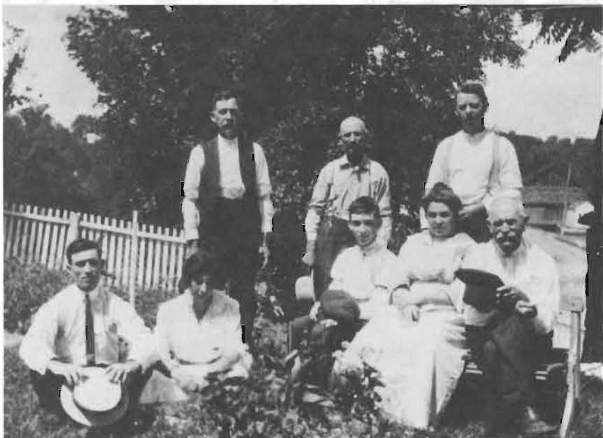
TAYLOR FAMILY AND FRIENDS WITH SNYDER-FERNSNER STORE AND SHANTY, LOCK 48, BACKGROUND